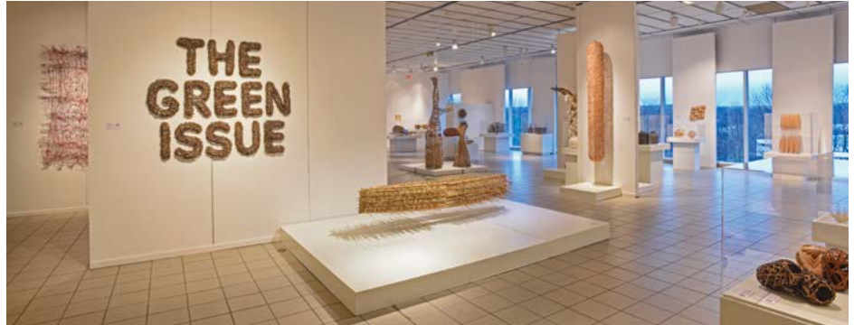
2016 Green From the Get Go Installation at the Morris Museum